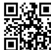
mobile app accessible via scanning QR code